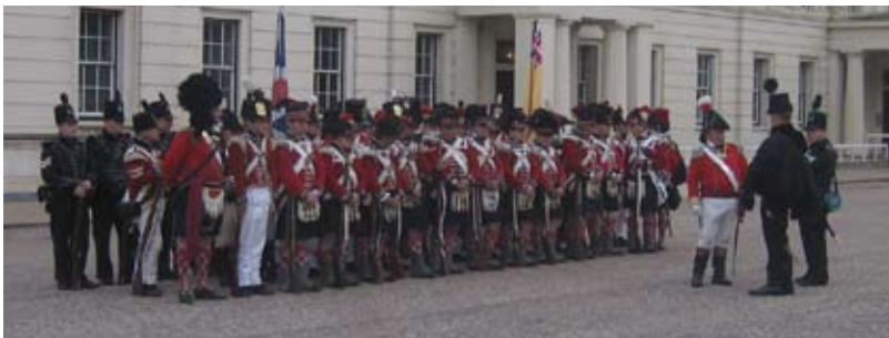
Drill Square at Wellington Barracks

In April this year we had a pretty clear view of the way ahead and set off along the planned road with lots of support. The events in June at Horse Guards and in Vitoria were extremely high profile getting lots of good press as well as jolly good fun. As with all plans we expected some changes and we have not been disappointed. Firstly there seems to be no appetite for an event at Waterloo in 2014 from any of the main organisers. So that comes out of the calendar completely. The event at Royal Hospital Chelsea has been moved to 2015 as a post bicentenary celebration as it conflicts with the Chalk Valley event that a number of units have already signed up to. The Colchester Military Tattoo will now be run in July the week before Blenheim which will be a challenge, but we are confident that it is something that we can do. We will keep the number of events attributed to the Road to Waterloo Campaign down to a minimum but they will need the support of everyone if they are to be successful.